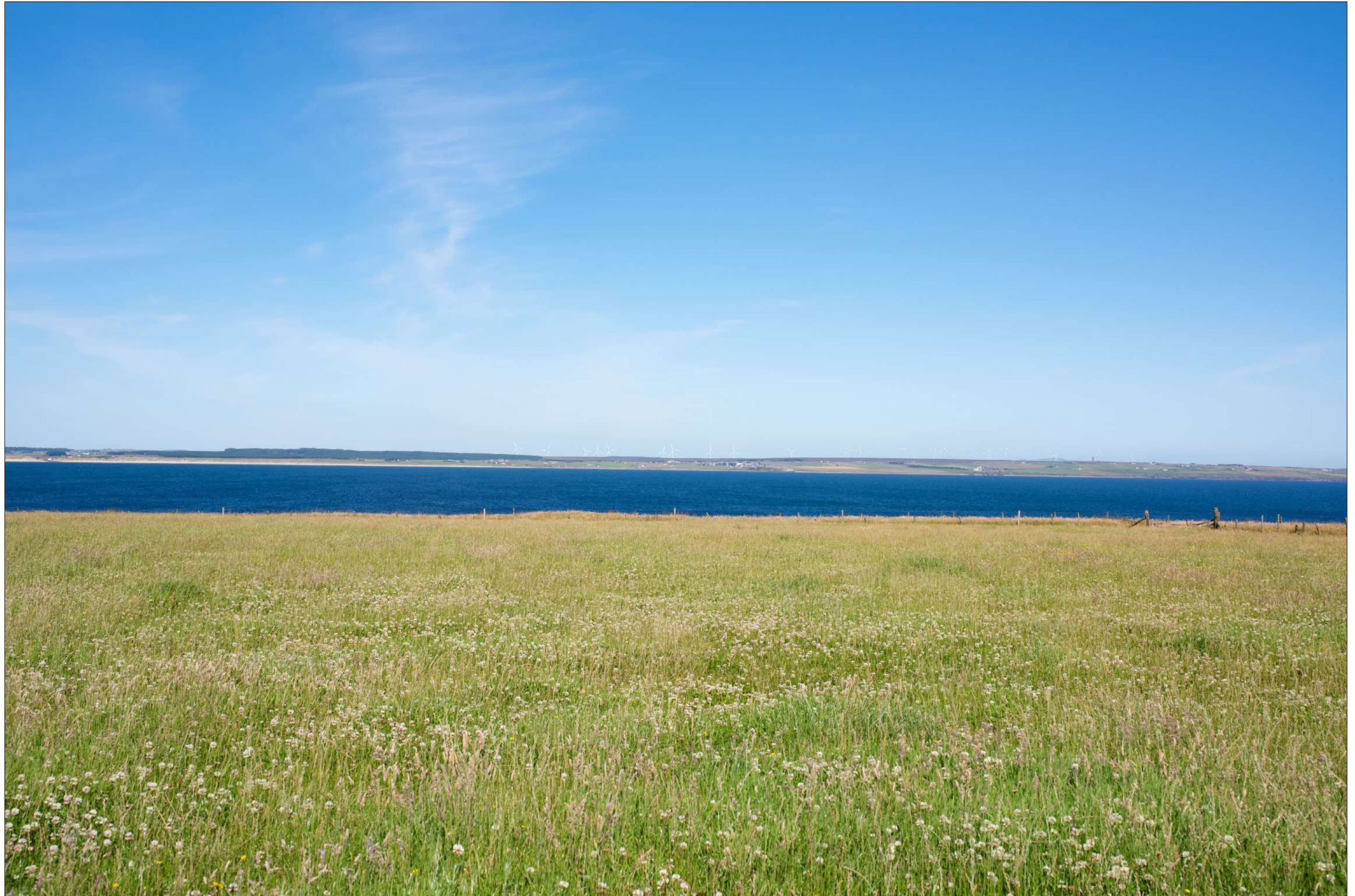
Figure: 7.31-THC-03 Viewpoint 18: Noss Head

When viewed at a comfortable arm's length (approx. 500 mm), this printed image is representative of our detailed central vision, but is not representative of scale and distance.