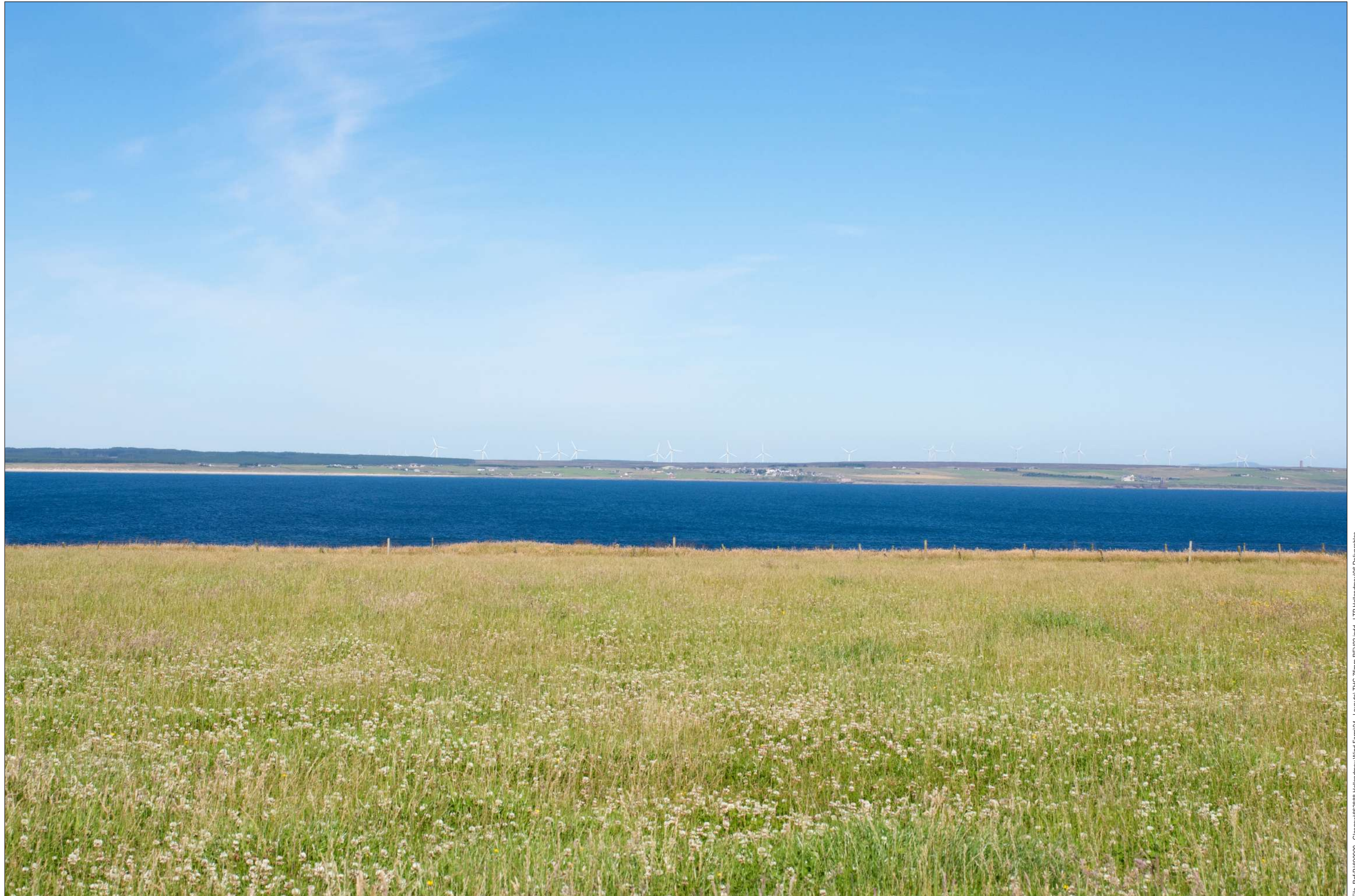
Figure: 7.31-THC-04 Viewpoint 18: Noss Head

This image should be viewed at a comfortable arm's length (Approx. 500 mm)